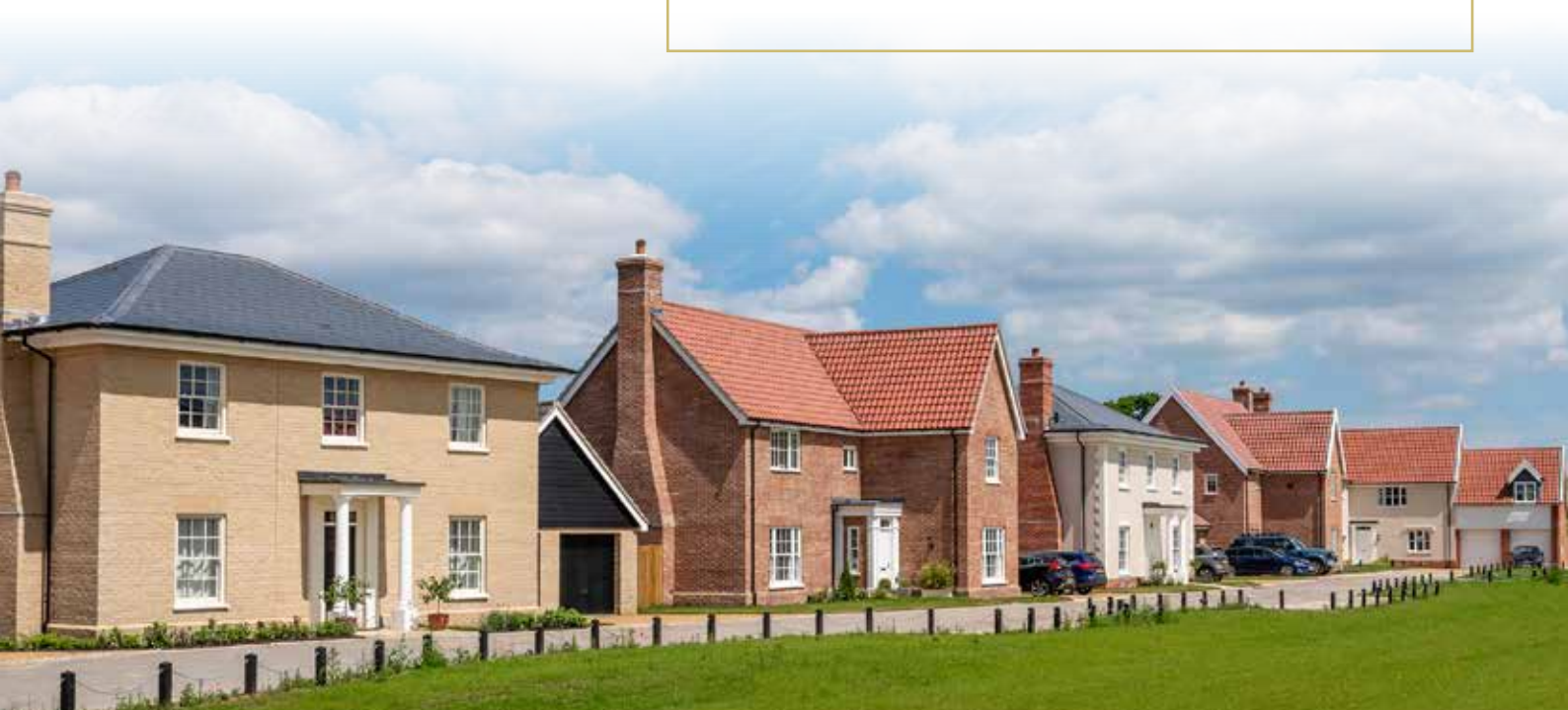
Homes previously delivered by Hopkins Homes

Write to us at: Freepost MPC CONSULTATION (no stamp needed)